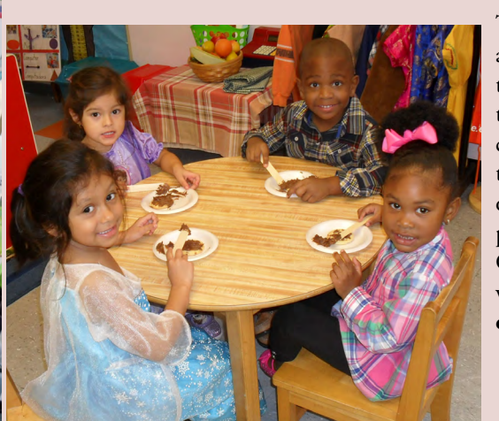
To better appreciate their services to our community, take a tour of the phenomenal CCANO website: ccano.org